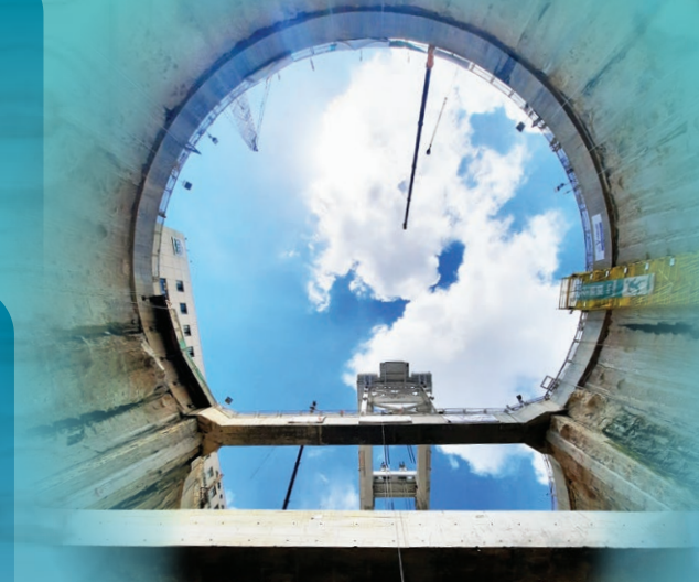
花生形啓動豎井 Peanut-shaped launching shaft